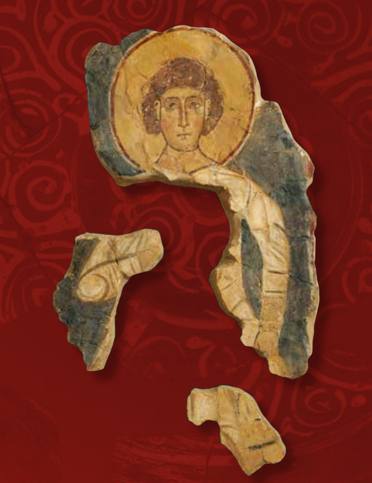
Argolis: a Crossroads of Civilizations

The second sub-unity, titled "At the Market of Byzantine Argolis", deals with the activities of professionals in a Byzantine city, placing emphasis on the builder, the painter and the potter, whereas artefacts that were used in a variety of transactions and trade, such as balances, weights ( stathmia ) and coins have been included in the exhibits. The sub-unity is completed with the "conveyors" of sea trade, which are no other than the amphorae, whereas an iron ring attached to the rim of the wooden wheel of a cart functions as evidence of land trade.