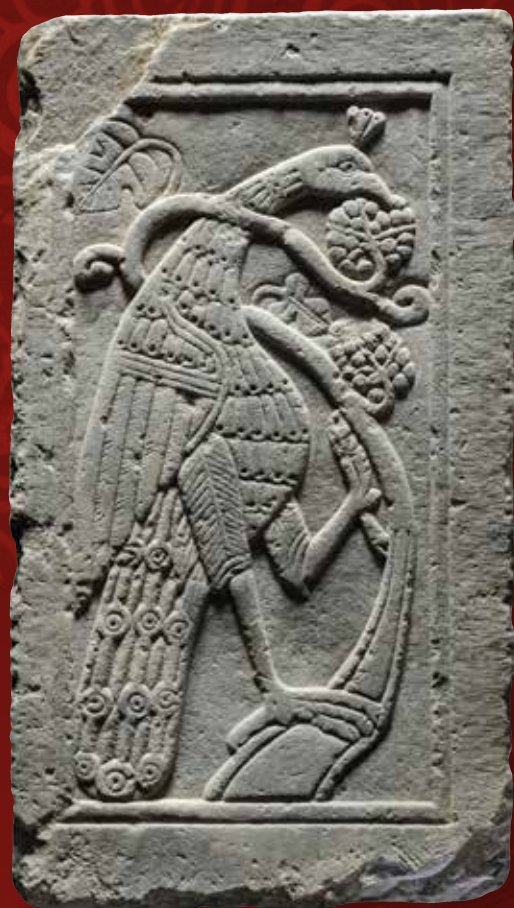
Life in the Byzantine Home

The third unity, entitled "Middle Byzantine Argolis" is the "heart" of the exhibition that brings together the greatest part of the exhibits. It is articulated in three large sub-units, of which the first centres on the church which in medieval life becomes the focal point not just of public worship, but of public life in general, thus substituting the ancient Agora. The space has been arranged into a small chapel with significant ktetoric and dedicatory inscriptions at its entrance, marble members and murals that decorate its interior.